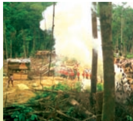
Black day for the Penan: On 28 September 1993, the blockade of Long Ajeng was broken up by force.